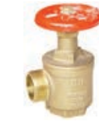
1.5" or 2.5" 300 psi Fire Dept. Valve