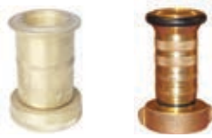
Cast Brass Adjustable Fog Nozzle