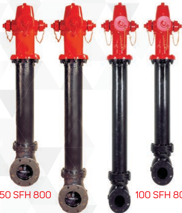
150 SFH 800