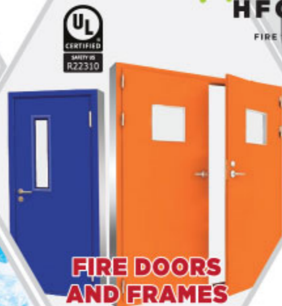
FIRE DOORS AND FRAMES