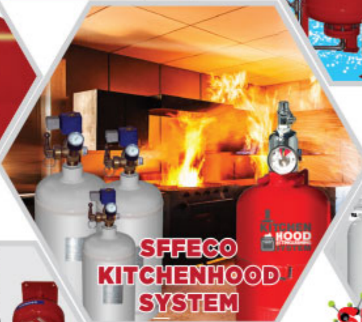
SFFECO KITCHENHOOD SYSTEM