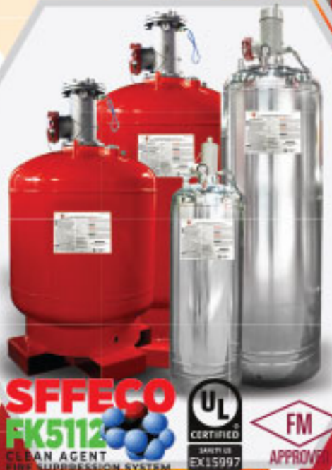
SFFECO FK5112 CLEAN AGENT FIRE SUPPRESSION SYSTEM