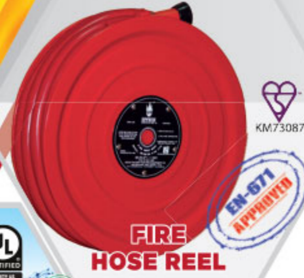
FIRE HOSE REEL