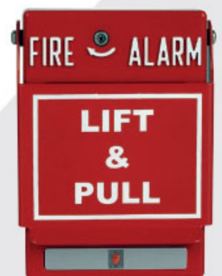
Manual Pull Station