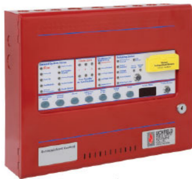
Releasing Control Panel