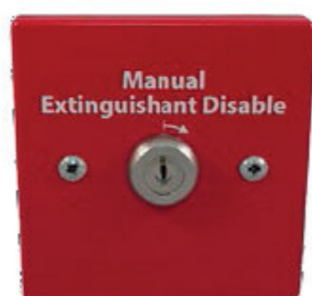
Manual Disablement Switch