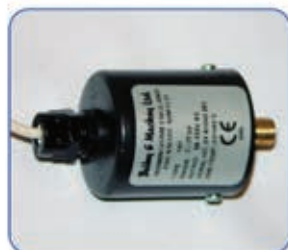
Pressure Switch (Optional)