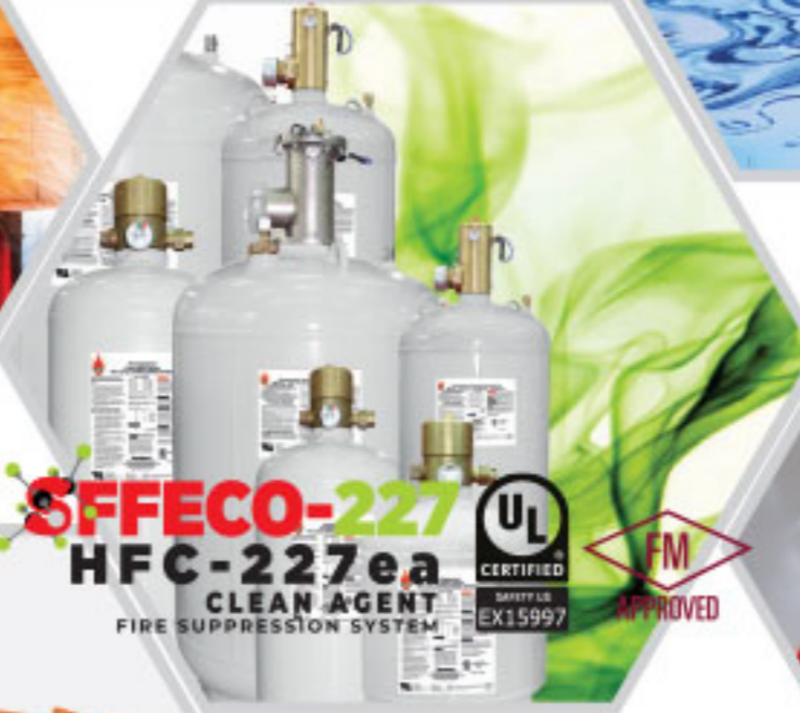
SFFECO-227 HFC-227ea CLEAN AGENT FIRE SUPPRESSION SYSTEM