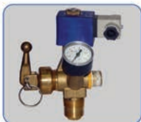
Solenoid & Cylinder Head Valve