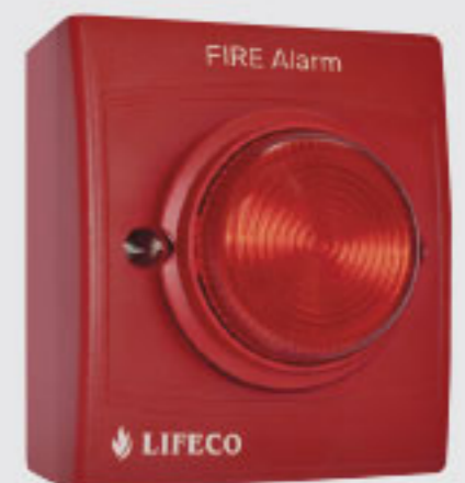
Sounder with Beacon