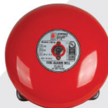
Fire Alarm Bell