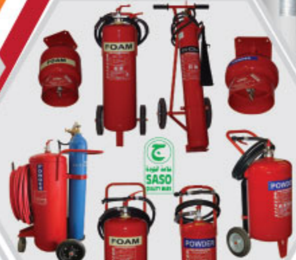
TROLLEY / MODULAR EXTINGUISHERS