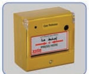
Manual Release Unit