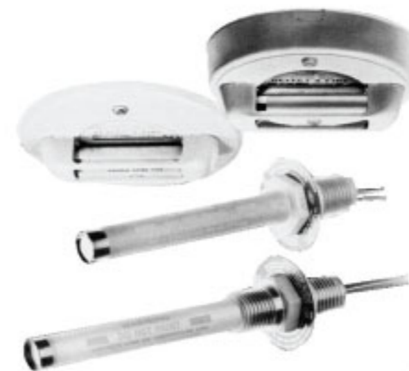
Detection & Release Device