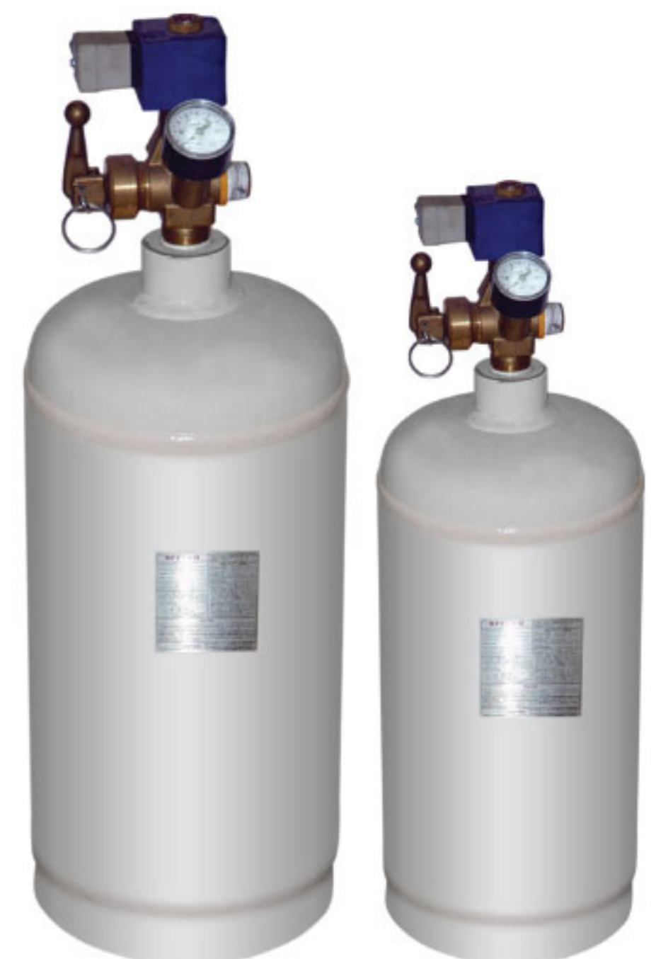
Kitchen hood Cylinders

It is simple to install and having sensitive detection system to assure sensing fire from the cradle and injecting the wet chemical agent in a way to secure quick fire extinguishing.