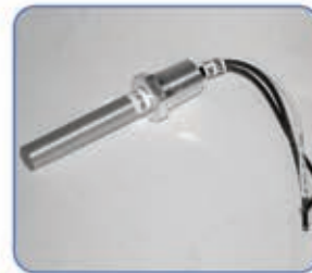
Pin type Heat Detector