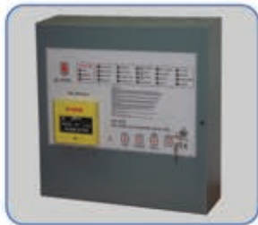
Extinguishing Control Panel